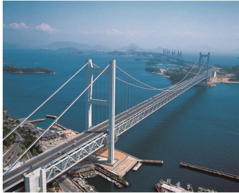
Great Seto Bridge